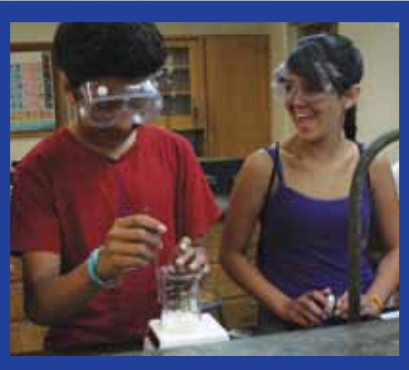
Pacific High School students enjoyed making a homemade version of lip balm in one of several workshops. Approximately 200 students from five San Bernardino high schools spent May 20th learning about science and technology careers through workshops and hands-on experiments at SBVC.